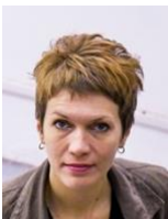
Online Only