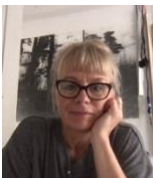
Eileen White Online Only

grafik 2.1 (b. 1961 Stockton on Tees) is a visual creative predominantly working through the medium of the silkscreen print [serigraph]: juxtaposing [layered] geometric line and form, giving reference towards the fragmented locale of the communal passageway. Selected solo exhibitions include: Untitled, B&D Studios, Newcastle upon Tyne (2019), and Outside, System Gallery, Newcastle upon Tyne (1999). Selected group exhibitions include: Annual Open, Royal Scottish Academy, Edinburgh (2019); MiniMaxi, Gallery Heike Arndt DK, Berlin (2019); Black Cube Collective Print3, Whitespace Gallery, Edinburgh (2014); and Druck Berlin, Stattbad Wedding, Berlin (2013). grafik 2.1 was presented with the East London Printmakers Award while participating within the Woolwich Contemporary Print Fair (2021) and received a Research and Development Bursary from the Middlesbrough Institute of Modern Art (2013). grafik 2.1 studied MA Future Design at Teesside University, Middlesbrough (2011), and currently lives Newcastle upon Tyne.