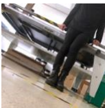
grafik 2.1 Online Only

Ind Solnick (b. 1994 London, UK) is a painter and sculptor. Ind's practice is rooted in a study of land, perceiving a language of form and an opportunity to re-envision the integration of nature into our cities. In her works, questions of value and hierarchy, regarding material, social structures or land, are gently pushed towards the viewer. Selected exhibitions include: At The Edge of Safehouse, London (2022); Fluid, London (2022); Grasswork, London (2021); The Retreat: This is Not a Holiday, Cheltenham (2018); and Art Letter Home, touring Chongqing, Suzhou; and Shenyang museums (2017-19). Ind has won the Haworth Scholarship for Painting, Slade (2021) and The Retreat Prize, Wimbledon (2017). She is studying MFA Painting at Slade School of Art (2021-23) and previously studied BA Painting at Wimbledon College of Art (2014-17). Ind Solnick lives and works in London and Helsinki.